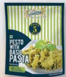
Pesto with Basil Pasta 65 gm