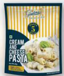
Cream and Cheese Pasta 65 gm