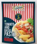
Tomato and Basil Pasta 65 gm